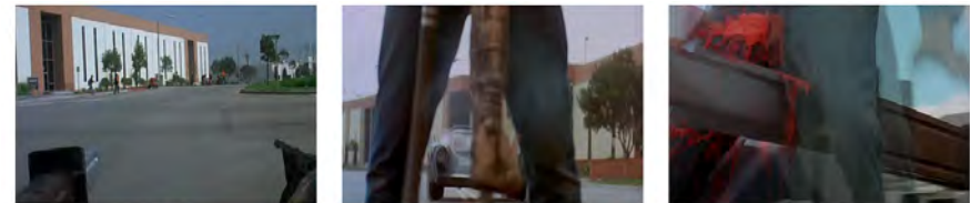
Images 2-4 captured shots first race victim DEATH RACE 2000 (New World Pictures, 1975)

The killings are depicted in the most graphic way possible. Giant swords on the fronts of the cars skewer victims. Others are run over several times.” (27 April 1975). 11 What Ebert noted was that the audience loved the over-the-top violence of the movie even though “at least half [of them were] small children” (ibid.). The film was R-rated, so it should have only been accessible to children accompanied by an adult, but according to Ebert, “the vast majority of the kids (and by kids I mean under 10 years old) were without parents or guardians.” (ibid.). To give an idea of what these children saw, here is a sequence of captured shots that take place shortly after the start of the race, where an unsuspecting road worker is maimed before death: