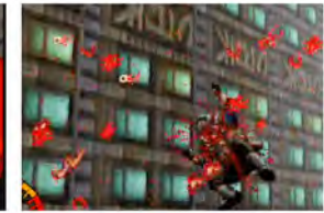
Image 14 details of another hit

Still the game was only banned in certain countries, for most countries the game's age restriction sufficed with or without the colour modification. Moreover, although there was some coverage in the news, people no longer protested in large numbers. In fact, the game's name became a synonym for monster traffic jams, especially in the US.