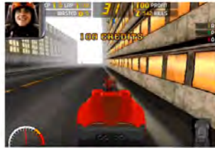
Image 10 Hitting an able adult