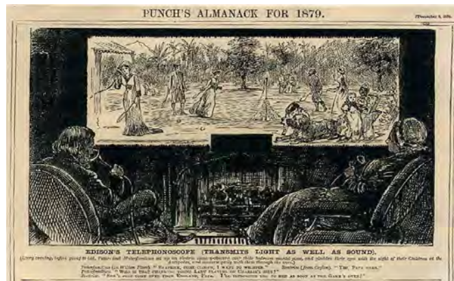
Image 1 New inventions were not only feared but also ridiculed as in this picture from Punch's Almanack 9

religion. Introduce the printing press with movable type, and you do the same. Introduce speed-of-light transmission of images [TV] and you make a cultural revolution.” (Postman, pp. 162-163). However, that does not imply that such changes are always for the worse. Remember, even the venerated book was once under suspicion: “he so immersed himself in those romances that he spent whole days and nights over his books; and thus with little sleeping and much reading, his brains dried up to such a degree that he lost the use of his reason...” (Cervantes, Don Quichote , 1605 trans. 1994).