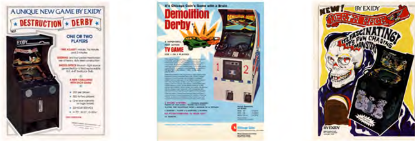
Image 6-8 Flyers for the games DESTRUCTION DERBY , DEMOLITION DERBY and DEATH RACE