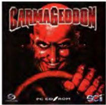
Image 9 Box graphics