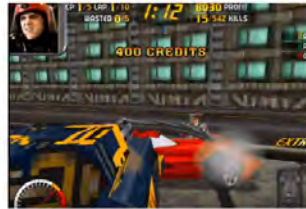
Image 11 Hitting an old lady

As is clear from image 10 and 11 during racing there is not much detail of the actual hit, although it is clear that CARMAGEDDON has a lot more graphic detail than DEATH RACE . However, CARMAGEDDON includes an 'instant replay' feature where the action is shown close up in all its gory detail: