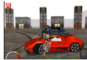
Image12 the infirm lady is hit

As is clear from image 10 and 11 during racing there is not much detail of the actual hit, although it is clear that CARMAGEDDON has a lot more graphic detail than DEATH RACE . However, CARMAGEDDON includes an 'instant replay' feature where the action is shown close up in all its gory detail: