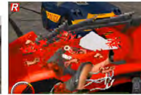
Image 13 her body parts fly around